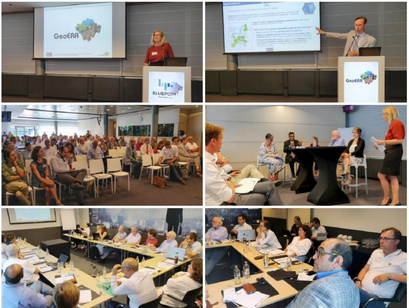
Part 1 – GeoEra Public Session and Part 2 – GeoEra Internal Session (FRAME Project Meeting)