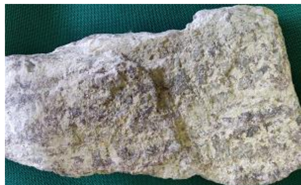
Fig. 2 Lepidolite from the Gonçalo region in northern Portugal.