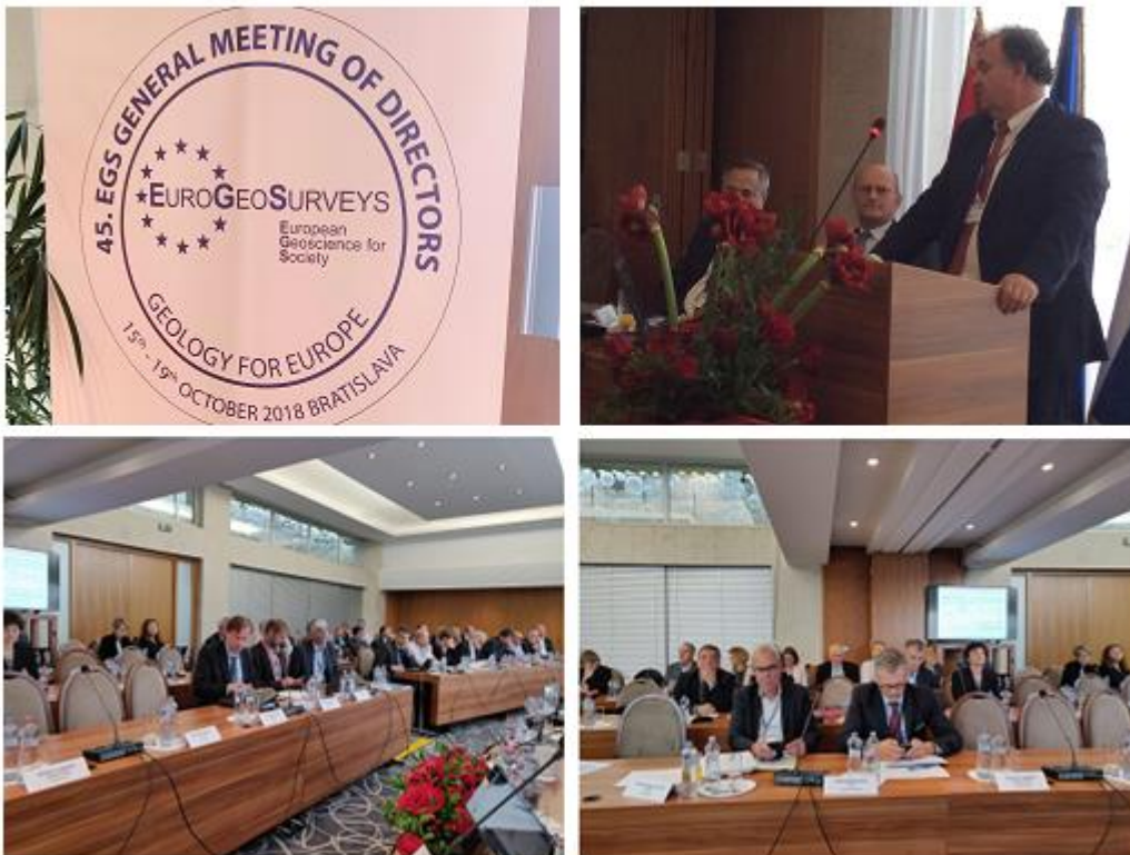
45th EuroGeoSurveys Directors' Workshop

FRAME Project was represented at the 45 th EuroGeoSurveys Directors' Workshop that took place in Bratislava on the 17 October 2018. The project generated much interest amongst the representatives in attendance because it deals with the next set of data that the European Commission needs because it handles aspects of the Circular Economy, the Critical Raw Materials and the Battery Initiative.