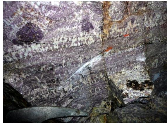
Fig. 1 Chèdeville Lepidolite-petalite subtype LCT pegmatite (France). Aplites showing unidirectional solidification textures to the top, made of layers of fine-grained purple lepidolite and quartz alternating with layers of white coarse albite crystals. Avoid mass of lepidolite+quartz are also present on left top (hammer for scale).

In Europe, lithium resources occur in several forms, including hard rock hosted and geothermal brines. Portugal, Spain, Austria, Finland, France, (Fig. 1) Czech Republic, Germany and Ireland among others, have high potential for Li-rich pegmatites and granites.