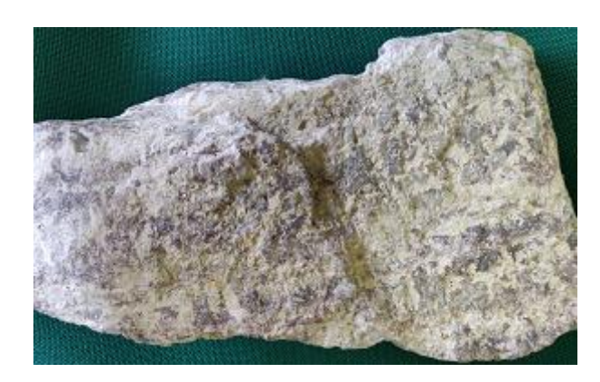
Fig. 2 Lepidolite from the Gonçalo region in northern Portugal.