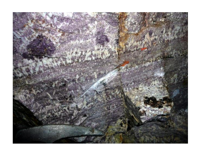
Fig. 1 Chèdeville Lepidolite-petalite subtype LCT pegmatite (France). Aplites showing unidirectional solidification textures to the top, made of layers of fine-grained purple lepidolite and quartz alternating with layers of white coarse albite crystals. Avoid mass of lepidolite+quartz are also present on left top (hammer for scale).

In Europe, lithium resources occur in several forms, including hard rock hosted and geothermal brines. Portugal, Spain, Austria, Finland, France, (Fig. 1) Czech Republic, Germany and Ireland among others, have high potential for Li-rich pegmatites and granites.